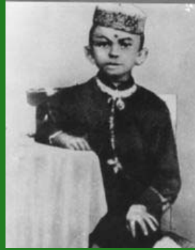
Mohandas. K. Gandhi, He was 7 years old when this picture was taken.

"I cannot teach you violence, as I do not myself believe in it. I can only teach you not to bow your heads before any one even at the cost of your life." - Mahatma Gandhi.