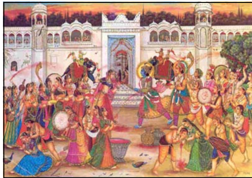
Holi celebrated by Lord Krishna and Radha along with Gopikas at Vrindavan (Mathura).

Holi ayi re..... 2007 seems to have so far turned out a pretty good year, with the Holi celebrations welcoming spring/summer in a riot of color, song and festivities. As the romantic excitement of February died down, it was the per-