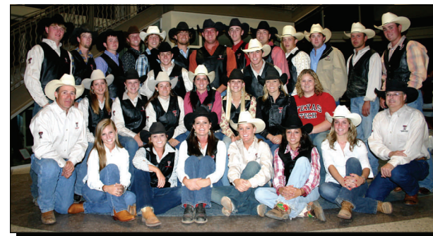
2006-2007 Texas Tech Rodeo Team

The enormous interest in rodeo, horses and agriculture at Texas Tech University, throughout the South Plains, and across the nation is phenomenal. We have established a top-notch rodeo program at Texas Tech University. Our annual rodeo has always been an exceptional, high quality event that is widely respected. Our teams are among the best in the nation. With a little added push we will be the premiere rodeo program in the world. We will never rest on our quest for the national championships.